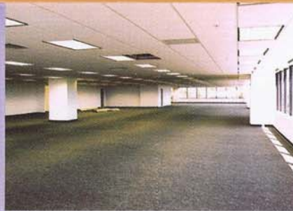
Enterprise IV Corporate Center Shelton, CT